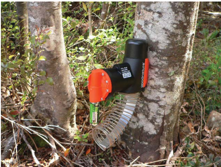
Photo of Goodnature A24 self re-setting rat trap with weka excluder fitted